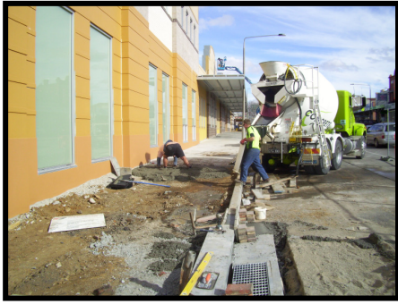
Divalls Earthmoving – pavement base at new Target project